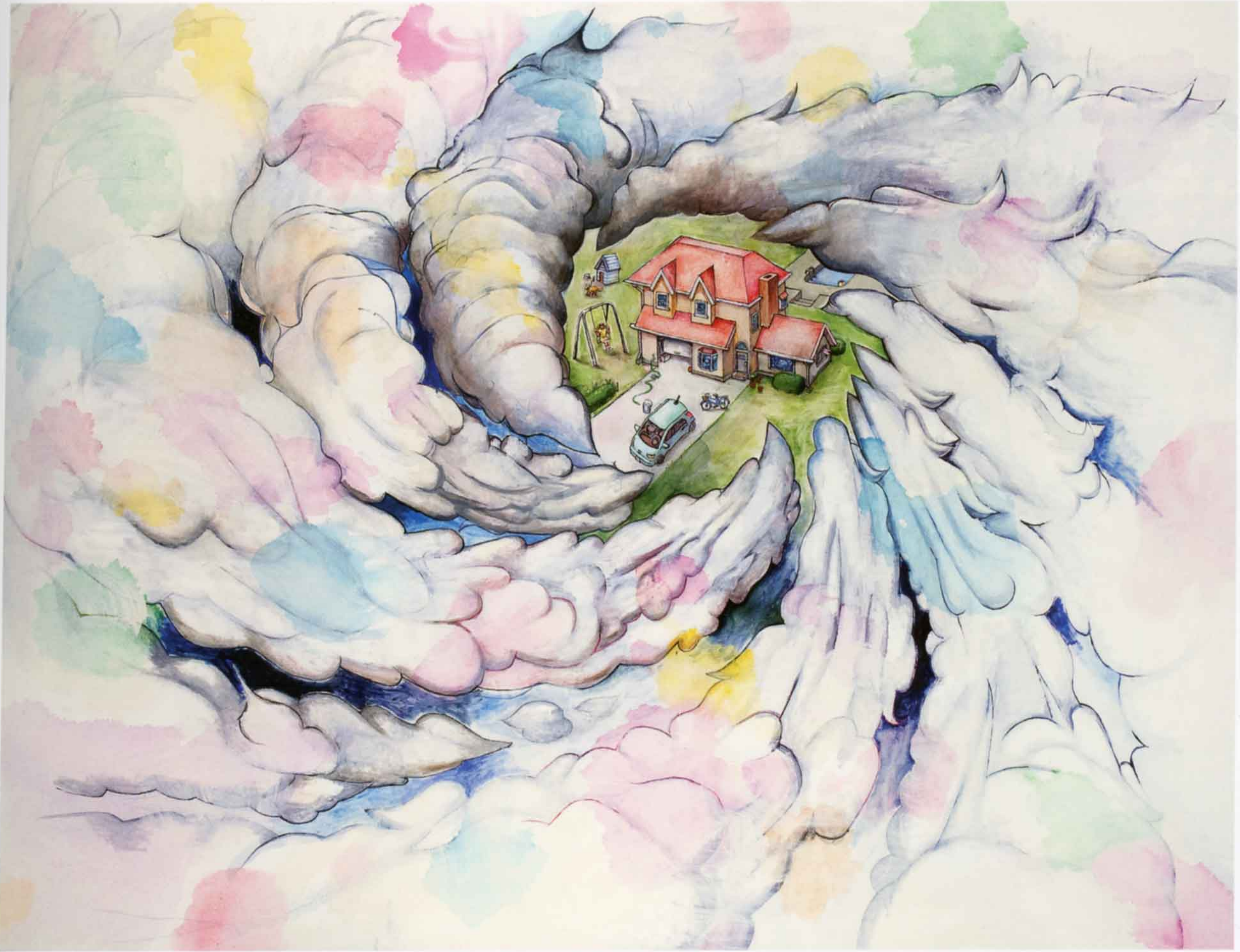
Eye of the Hurricane, 2011, by Hiro Sakaguchi

many rich configurations of narrative imagery and realist techniques, and the many artists whose works are included in this exhibition, offer us vehicles toward abstract configurations of thought that point to heightened awareness and a greater understanding of ourselves.