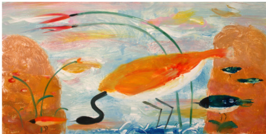
Valentina DuBasky, Cove Site with Amber Heron , 2013, Monotype, Edition: Unique, Courtesy of Tandem Press.